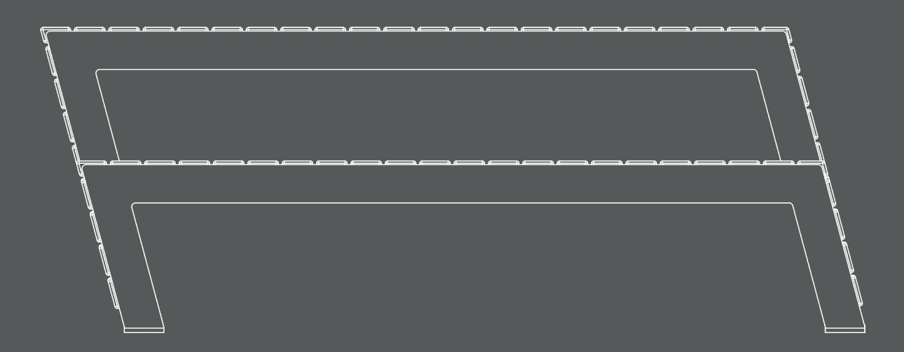
Table & Bench 1959mm Length Configuration 2

Table & Bench 1959mm Length Configuration 1